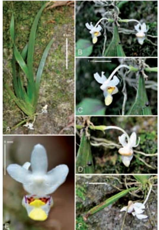
Fig. 2. Cordiglottis longipedicellata . — A: Habit. — B: Inflorescence. — C: Anterior view of flower. — D: Posterior view of flower. — E: Flower in front view. — F: Fruit.

Epiphytic herb, up to 20 cm long. Leaves 5–7, 18–20 × 1–1.2 cm, laterally flattened, slightly curved, fleshy, dark green, tips acute, base overlapping. Inflorescence 2-flowered, pendulous, 2–2.3 cm long; peduncle 0.5–0.8 cm long, glabrous. Floral bracts triangular, thin, apex acute, 1.5–2 × 1–1.5 mm. Flowers 2–2.5 cm diameter. Sepals white, translucent, glabrous, apex obtuse; dorsal sepal elliptic, 4–4.5 × 1.8–2 mm, lateral sepals elliptic-ovate, 4–4.5 × 1–1.5 mm, contracted at base. Petals white, similar to sepals, ovate, 5–5.5 × 1–1.7 mm. Lip white with purple spots at base and on margin of side lobes, disc and callus yellow, saccate, glabrous, more or less sigmoid, without a spur, 3-lobed, 4–5 × 2–2.5 mm; callus fleshy, glabrous, apex spatulate; side lobes erect, slightly angular-round, 3–4 mm long; midlobe almost flat at apex, slightly decurved, 6–7 × 3–4 mm. Column 2–2.2 mm long; foot prominent, nearly as long; anther cap round, 1–1.5 mm long; pedicel and ovary 1–1.2 cm long. Capsules narrowly cylindrical, 4–5 mm long, ca. 5 mm thick, dark green, opening by