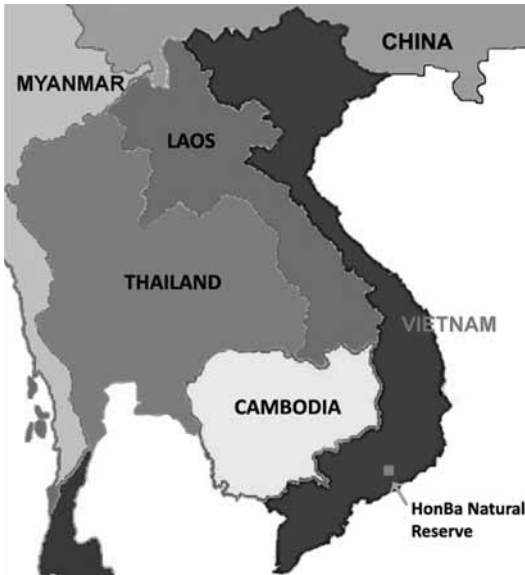
Fig. 1. Map showing the type locality of Cordiglottis longipedicellata in Vietnam.

Reserve, J. Lee et al. 10 April 2012 (HIKK, 1316 HN; isotype KRIB!).